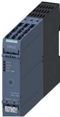
MOTOR STARTER 3RM1 SIRIUS DIRECT STARTER 500 V; 0,4-2,0 A; 110-230 V AC SCREW-TYPE CONNECTION SYSTEM